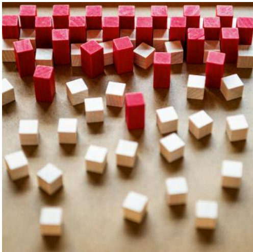
03_Untitled 4964, 2021 © Torrance York