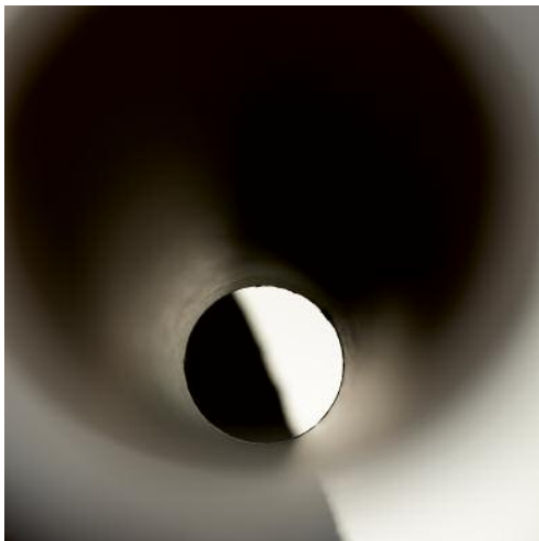
05_Untitled 9390, 2020 © Torrance York