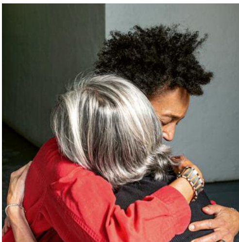
11_Untitled 7336, 2020