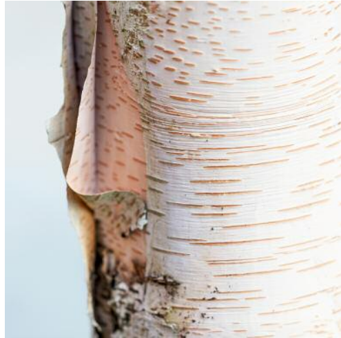
08_Untitled 4174, 2019 © Torrance York