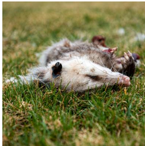
12_Untitled 6201, 2020