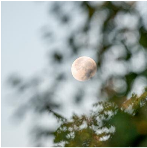
01_Untitled 1618, 2020 © Torrance York