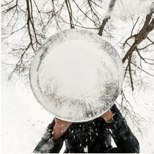
07_Untitled 5365, 2021 © Torrance York