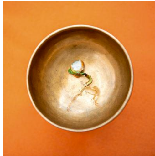
10_Untitled 6293, 2021