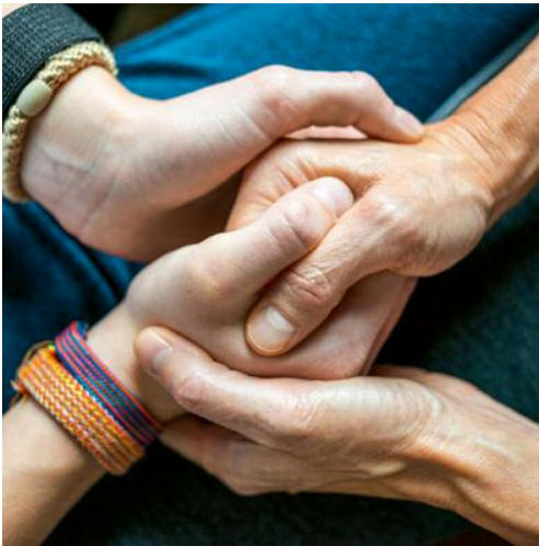
09_Untitled 8019, 2020 © Torrance York