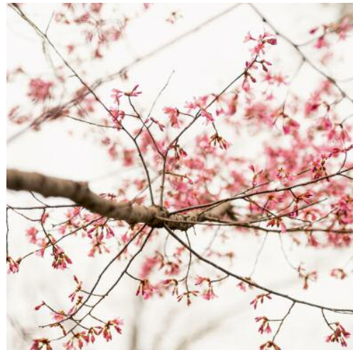
04_Untitled 51567, 2013